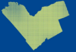
Table de direction sur le logement et l'itinérance

The 10-Year Plan is so high-level that it may be hard to see your organization or your clients in it. The Plan relies on everyone. Boards, leaders, front line staff and clients all have a role to play in the Plan's success. We urge you to have strategic conversations about how your work connects into the Plan and how we can work together.